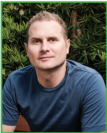
Daley Hake Photography